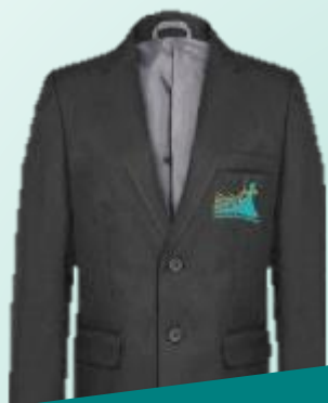
Saltash School blazer

There are no major changes to our uniform policy from previous years, but as we strive for excellence and equity, we will enforce our policy with ' no excuses ' to ensure that we hold every student to the same high standard. Tutors will check uniform at line up each morning. Please support us in setting the tone by ensuring your child comes to school in the correct attire.