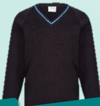
Black V necked jumper with sky blue stripe