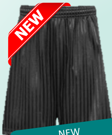
NEW Loose fitting, black PE shorts (not lycra.)

There are no major changes to our uniform policy from previous years, but as we strive for excellence and equity, we will enforce our policy with ' no excuses ' to ensure that we hold every student to the same high standard. Tutors will check uniform at line up each morning. Please support us in setting the tone by ensuring your child comes to school in the correct attire.