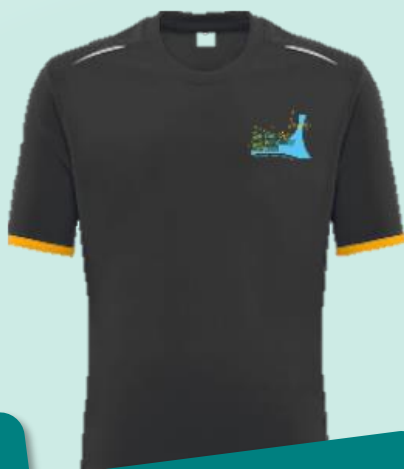
Black and gold T-shirt with school motif