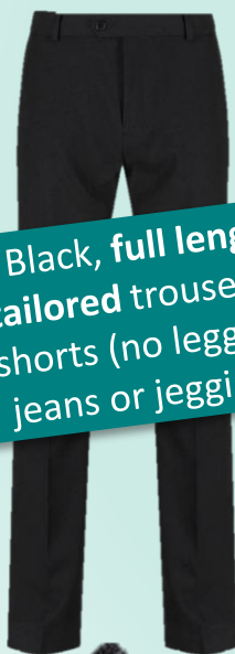
Black, full length tailored trousers or shorts (no leggings, jeans or jeggings.)