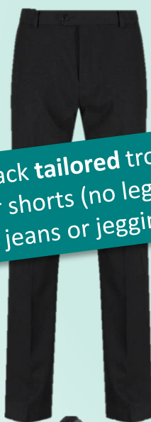
Black tailored trousers or shorts (no leggings, jeans or jeggings.)