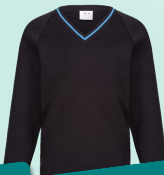
Black V necked jumper with sky blue stripe