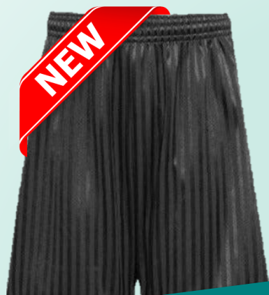
NEW Loose fitting, black PE shorts (not lycra.)

There are no major changes to our uniform policy from previous years, but as we strive for excellence and equity, we will enforce our policy with ' no excuses ' to ensure that we hold every student to the same high standard. Tutors will check uniform at line up each morning. Please support us in setting the tone by ensuring your child comes to school in the correct attire.