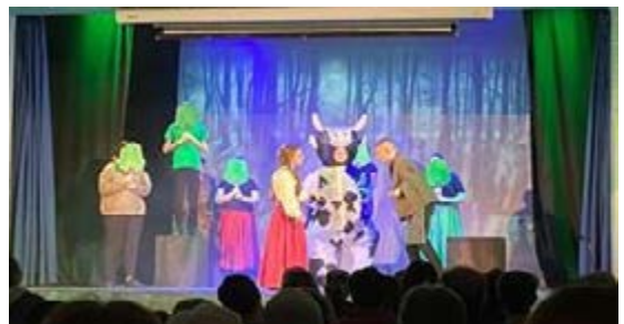
Saltash Community School Prospectus